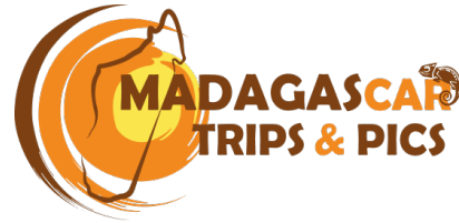
Photo Tour Available For Booking From October 8th To October 23rd, 2023.