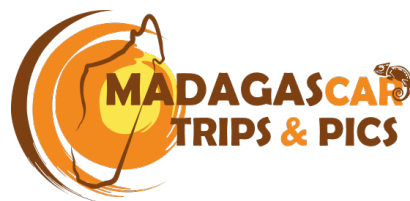
Photo Tour Available For Booking From October 8th To October 23rd, 2023.